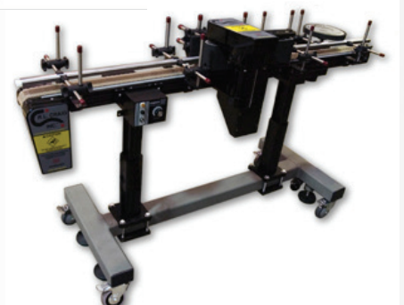
RLC 157 Wrap Station and Metering Wheel